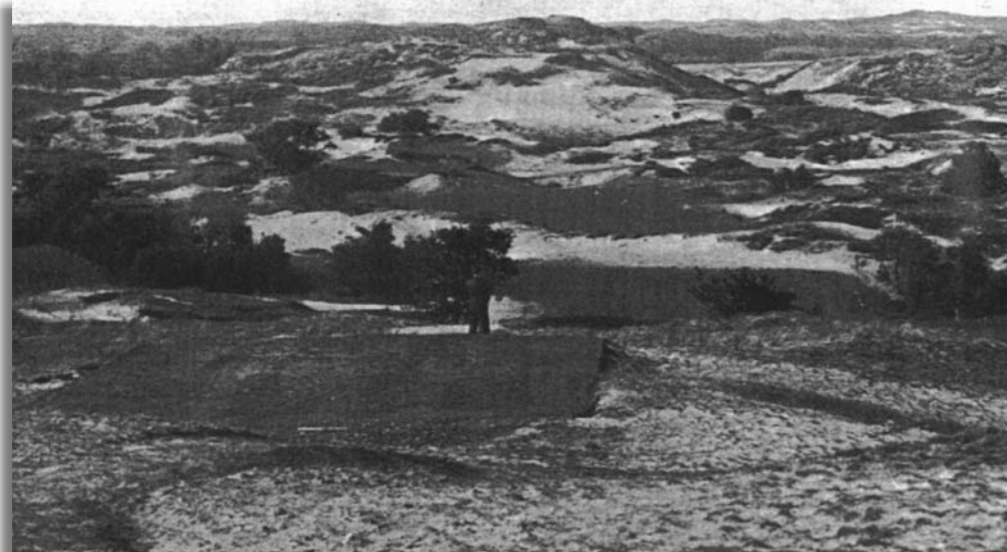
De korte 4e hole van 230 meter der Wassenaarsche baan, waarover wij hiernevens een en ander vertellen.

BELOW Royal Hague: A 1938 picture taken during the 'grow-in' phase of the course, showing the sandy wilderness surrounding the 230-metre par-3 fourth hole. Note the penal waste area in front of the green, forcing the weaker players to play a safe lay-up shot. (First published in Golf magazine.)