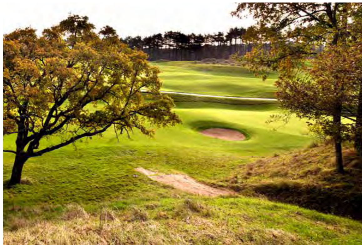
ABOVE: Undulating fairways and towering trees on the 10th hole. LEFT: Side on to the short 8th. BELOW: A view down the 11th fairway that turns left to right, with the par-3 12th further in the distance. BOTTOM: An alternative view of the 10th, showing the shape required to find this rippling fairway.