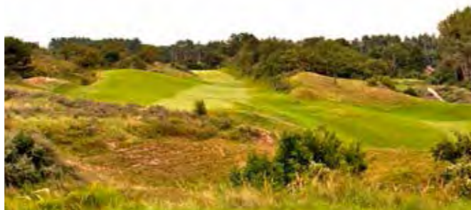
ABOVE: The uphill 9th is made more testing by a false front to a green on a dune. RIGHT: The 8th is, like the 4th, another downhill short hole with magnificent views. Everything is in clear sight on this par 3. LEFT: The 15th is part of a terrific closing stretch. Use the slopes on the left to nudge your ball onto the flat fairway.